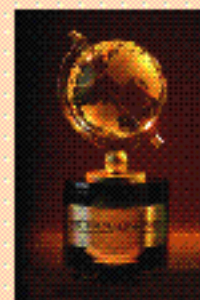
Tech Museum Award

Call : Sales: 99800 55566 Customer Care: 99800 77788 / 98800 88899