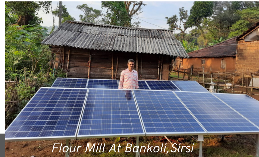
Flour Mill At Bankoli, Sirsi