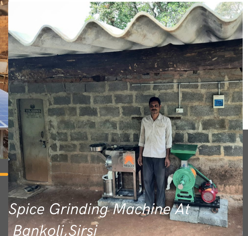
Spice Grinding Machine At Bankoli, Sirsi