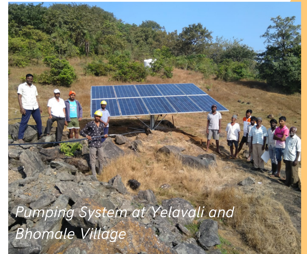
Pumping System at Yelavali and Bhomale Village