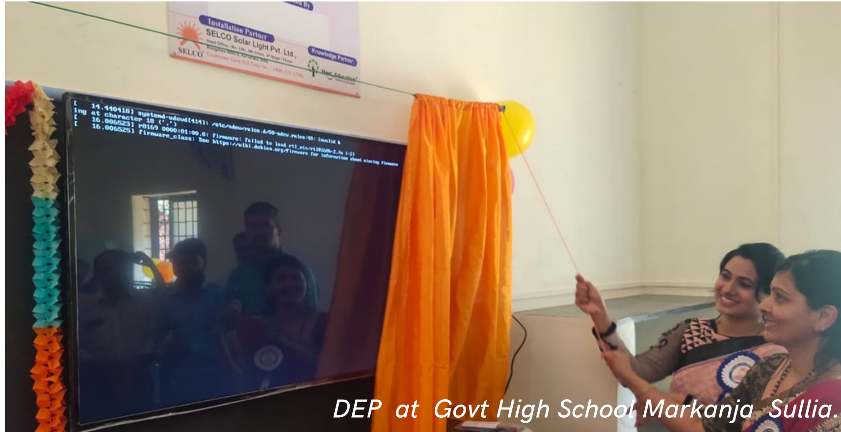
DEP at Govt High School Markanja Sullia.

Markanja is a village located in Sullia Taluk of Dakshina Kannada district in Karnataka. The village has a lot of power issues and a very poor mobile network, this has proved to be a hindrance for students to have access to modern educational facilities.