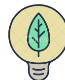
Energy Efficient Lights and Fans