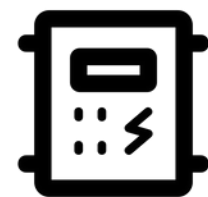
Solar Inverter 5 kW, 6 KVA, 96 V